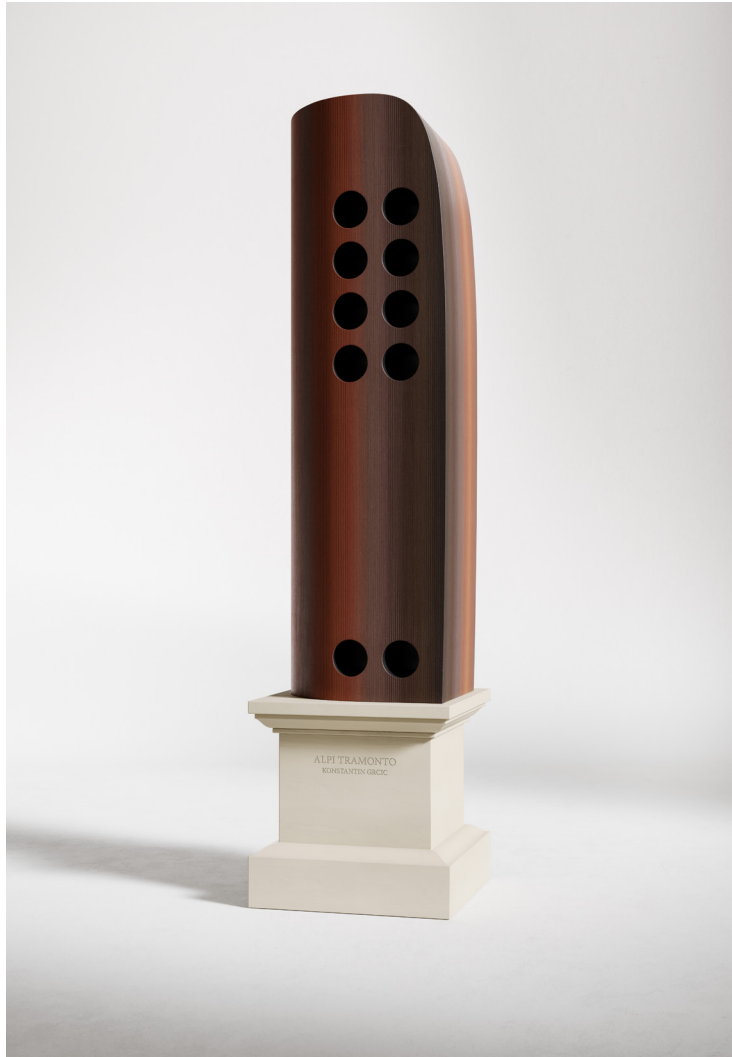
ALPI Tramonto design Konstantin Grcic