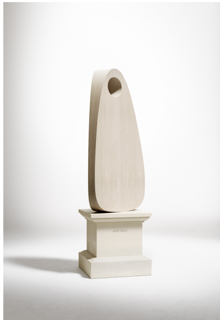
ALPI Xilo Striped White curated by Piero Lissoni