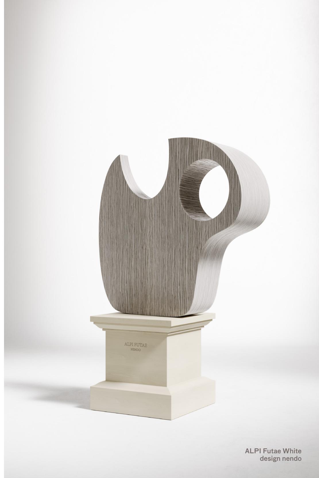
ALPI Futae White design nendo