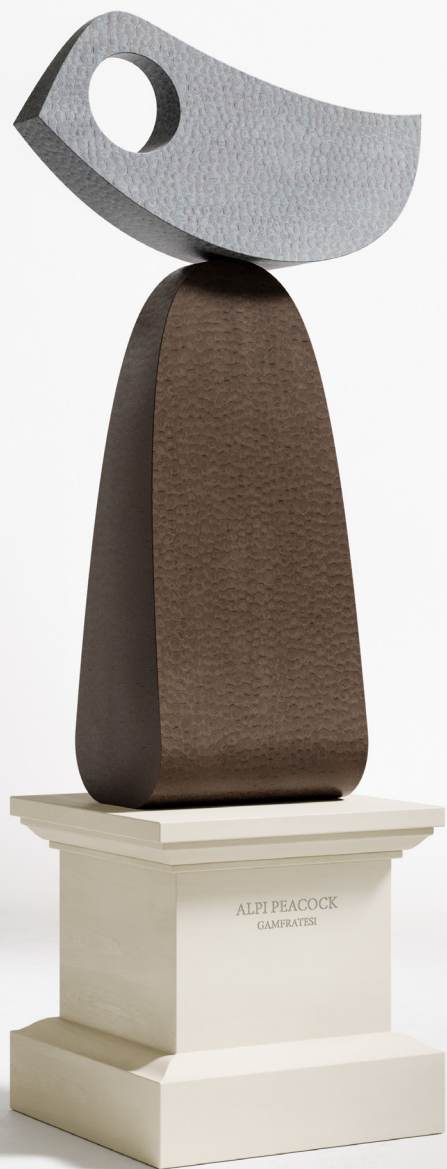
ALPI Peacock Brown / ALPI Peacock Grey design GamFratesi