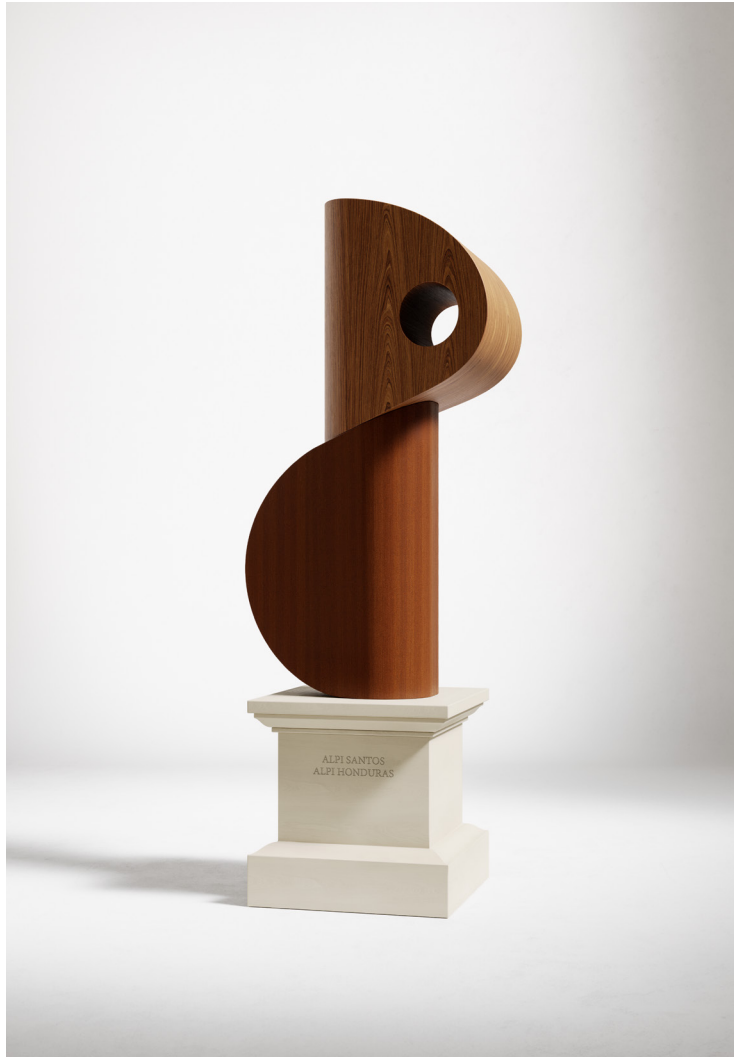
ALPI Santos / ALPI Honduras curated by Piero Lissoni