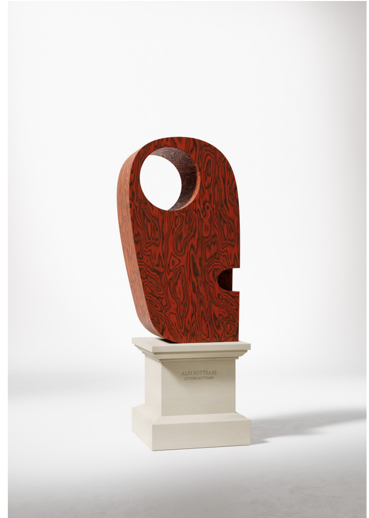
ALPI Sottsass Red design Ettore Sottsass